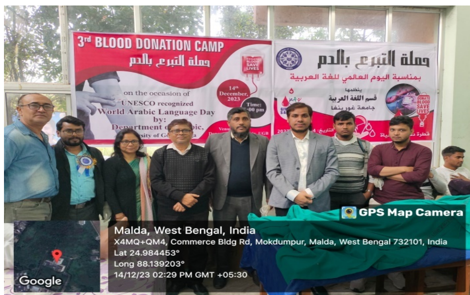
Blood Donation Camp- 14.12.2023