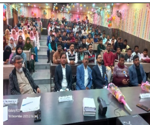
World Arabic Language Day celebration – 2023