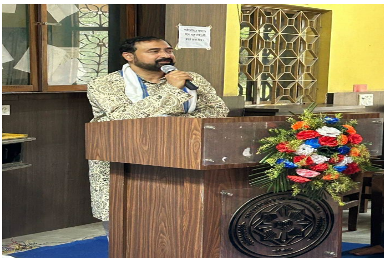
Dean of Arts delivering his speech on the occasion of the Museum Day Celebration at UGB