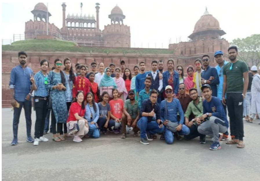
Educational Tour to Delhi-Agra (3 rd Semester Students) (18 to 24.03.2023)