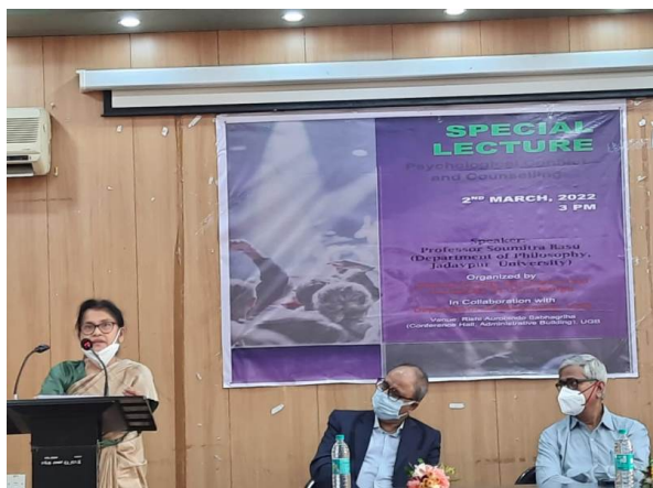
Special lecture on “Psychological Conflict and Counselling”

The Internal Quality Assurance Cell (IQAC) organized a special lecture on “Psychological Conflict and Counselling” on 02/03/2022 at Rishi Aurobindo Hall, UGB.