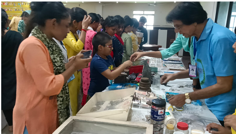
Celebration of International Museum Day at Central Library on 18.05.2023.

On 18 th May 2023, Central Library organized an exhibition on various rare & historical collections in connection with the celebration of International Museum Day at the University of Gour Banga.