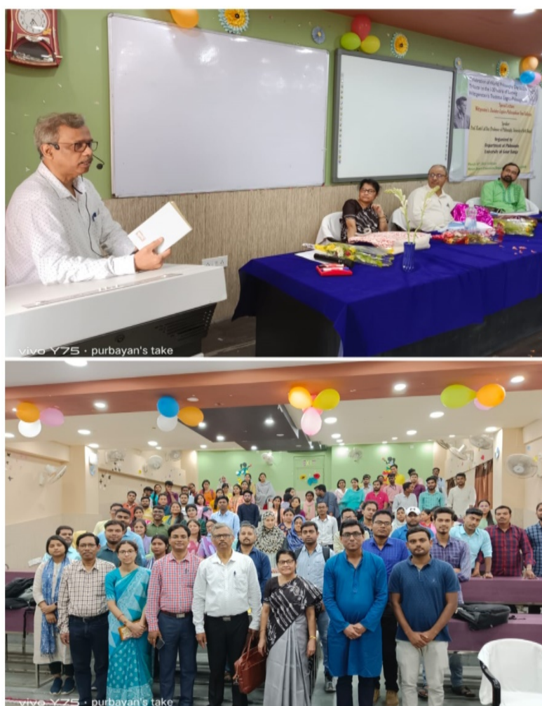
Celebration of World Philosophy Day-2022 & Tribute to the 100 Years of Ludwig Wittgenstein's Tractatus Logico-Philosophicus